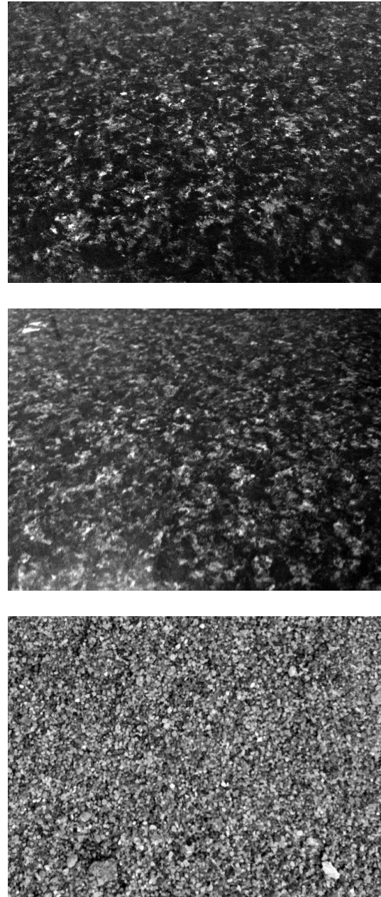
Fig (1) SEM micrographs for the prepared samples (a) CdO, (b) Zn_{0.1}Cd_{0.9}O , (c) Zn_{0.8}Cd_{0.2}O

The scanning electron microscope image illustrates the surface topography of Zn_{1-x}Cd_xO thin film in Fig. (1) for undoped and Zn doped CdO thin films. The film shows homogenous distribution with polycrystalline nature and has uniform spherical grains. The film dopant with 25% Zn concentration has small grains in compared with film Zn dopant concentration of 75% which show large grains clustered together within the surface. SEM images suggest that the films are showing crystalline nature for lower zinc doping and the films become amorphous for higher concentration of Zn doping.